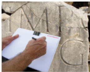
Outdoor drawing lessons.