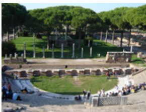
Ostia Antica. A City-port of Rome with its ruins surrounded by quiet greenery.