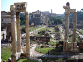
The Roman Forum